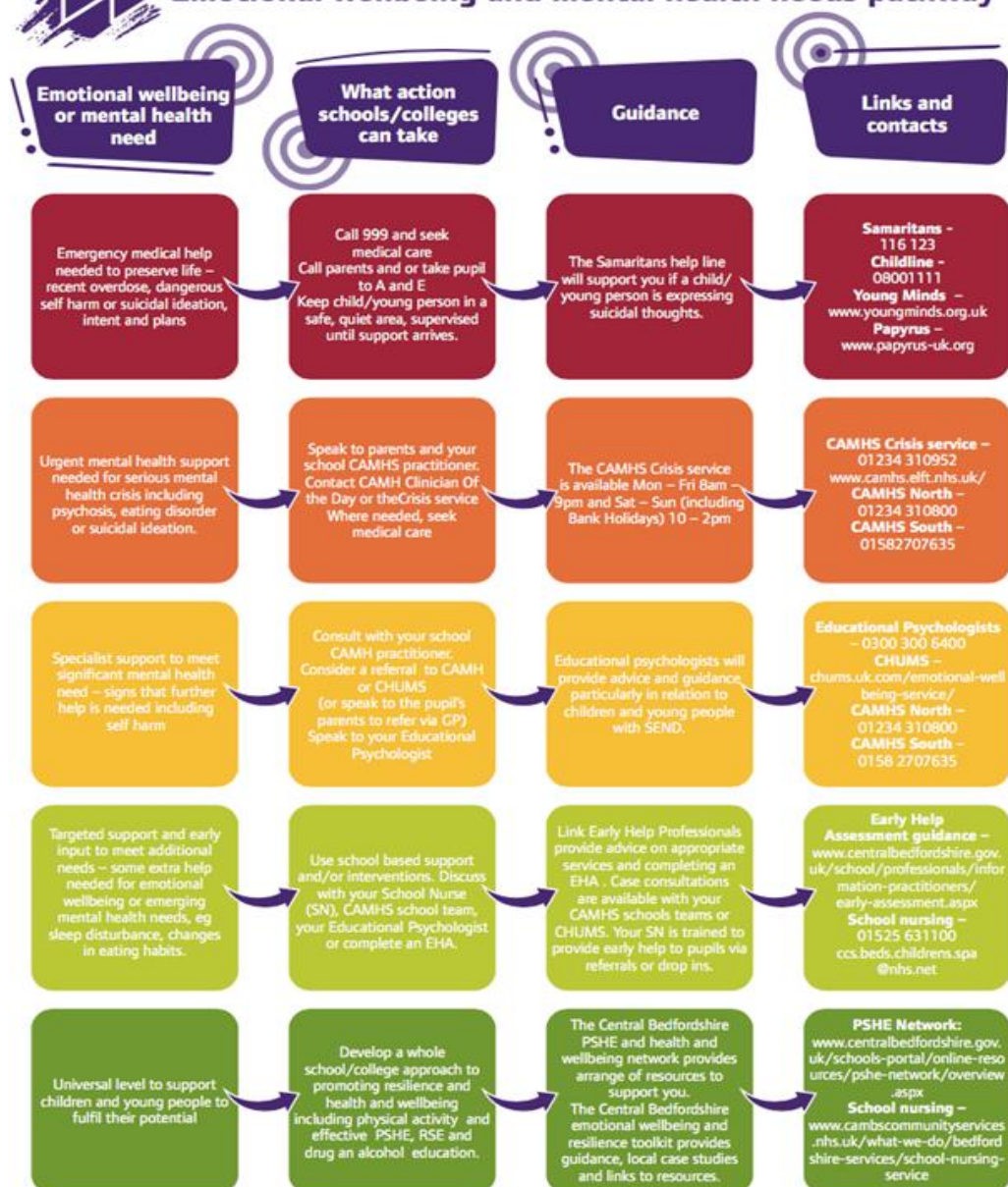
Appendix 5: CAMHS Referral Pathway